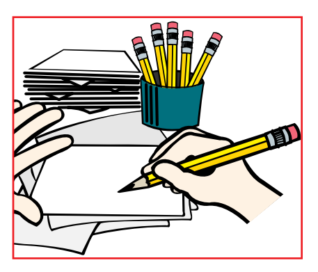
Write to us!