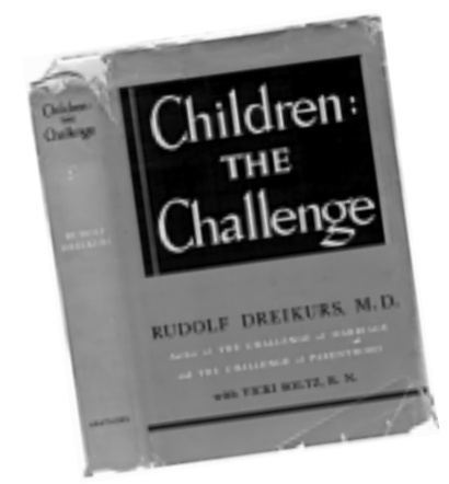
We've come a long way since Children: The Challenge, but many continue to use it. Did you know: it's perennially among international all-time best sellers.

Modern mothers and fathers are as able as those who first used the