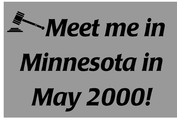
NASAP Annual Convention to be held May 11-13, 2000 in St. Paul, Minnesota.